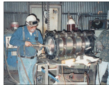
10" DIAMETER MULTI-BELLOWS EXP. JOINT