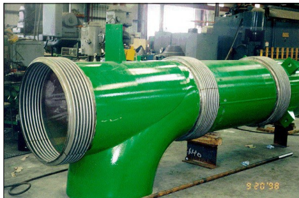
36" PRESSURE BALANCED EXP. JT. RATED FOR 150 P.S.I.