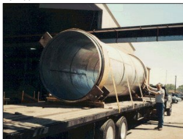
72" DIAMETER THIN WALL DUCT EXP. JT. RATED FOR 50 P.S.I.